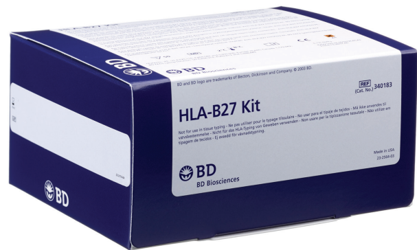
The BD HLA-B27 kit is a CE-IVD reagent Kit

For information related to the cell suspension preparation, see the IFU for the BD HLA-B27 reagent kit.