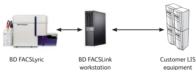
Figure 1. BD FACSLink LIS interface solution

Helps to improve laboratory productivity and data quality by eliminating manual data entry and reducing transcriptional errors.